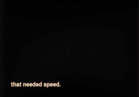
that needed speed.