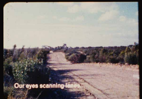
Our eyes scanning lanes...