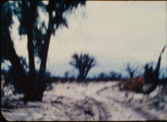
There were moments...