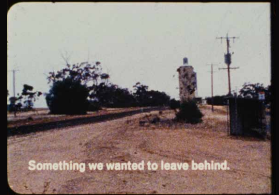
Something we wanted to leave behind.