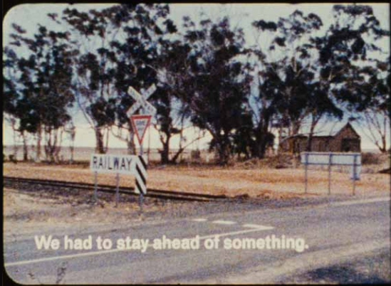
We had to stay ahead of something.