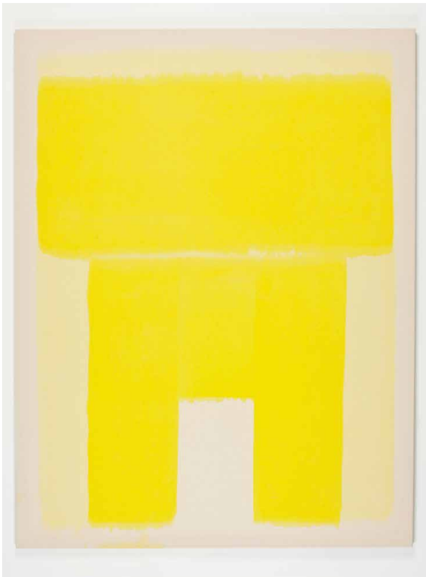
Monument, 2013, fabric dye on canvas, 135 x 175 cm