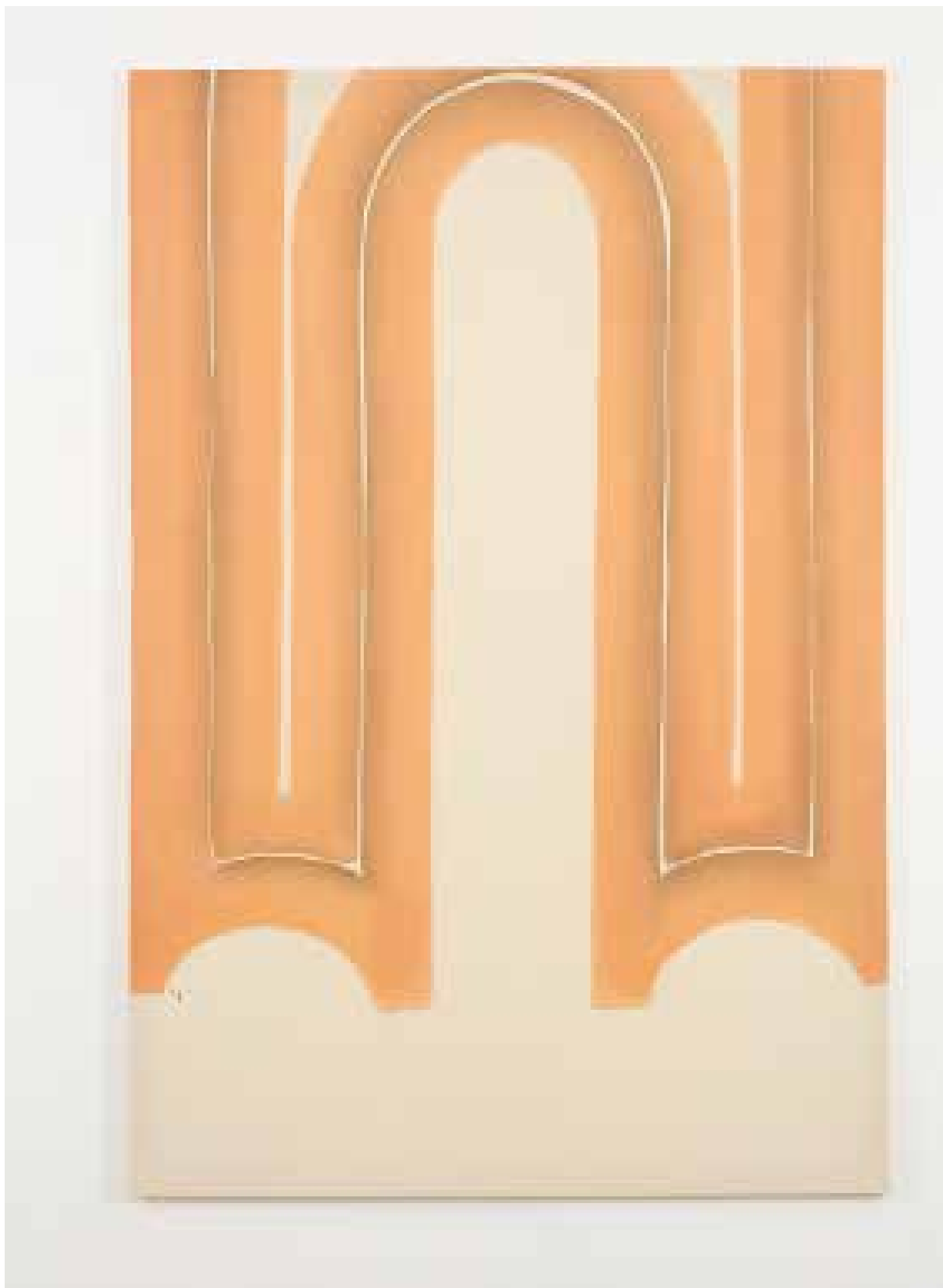
Untitled, 2015, fabric dye on calico, 230 x 153 cm