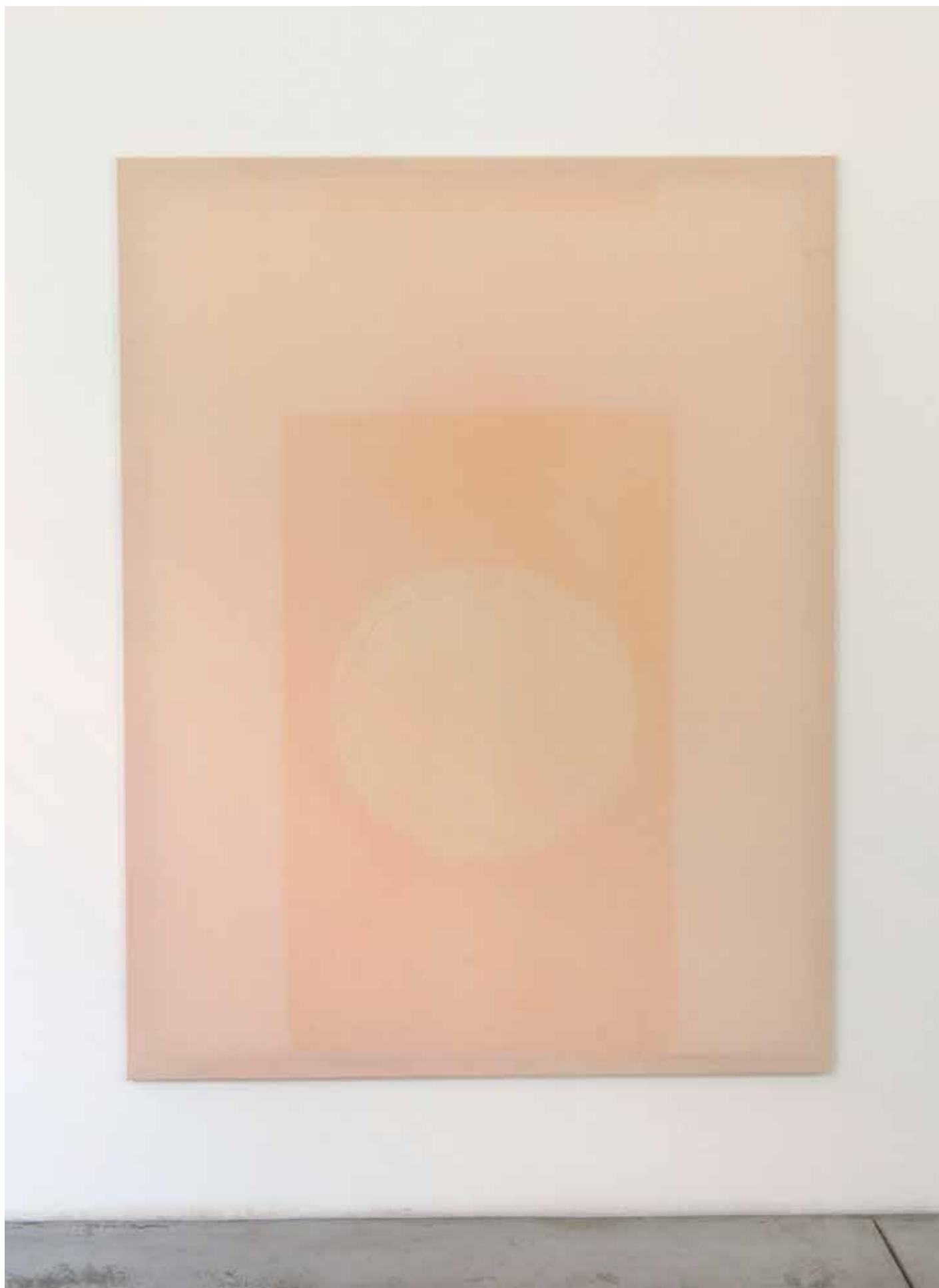
Morning, 2014, fabric dye on canvas, 135 x 175 cm