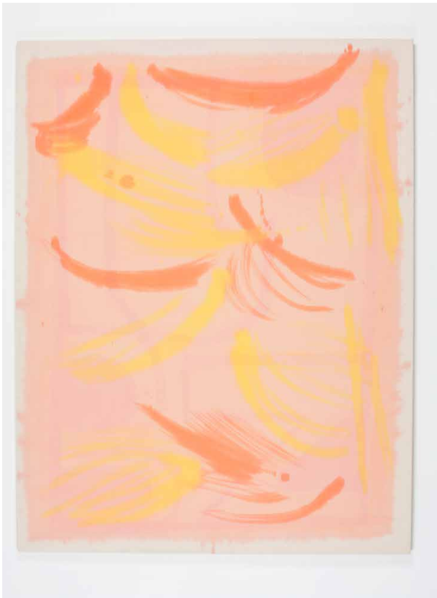
Autumn In A, 2013, fabric dye on canvas, 135 x 175cm