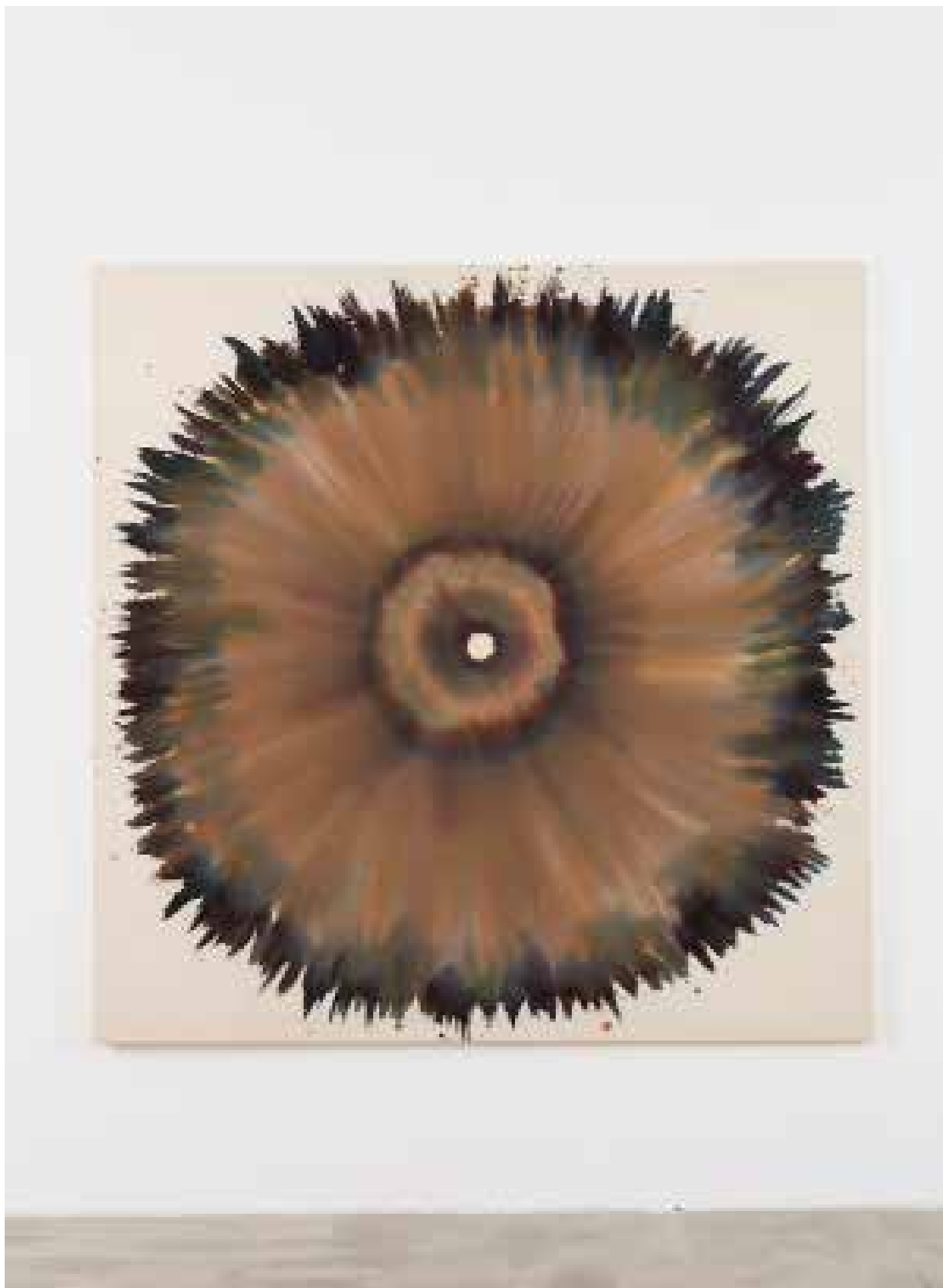
Untitled, 2015, fabric dye on calico, 230 x 153 cm