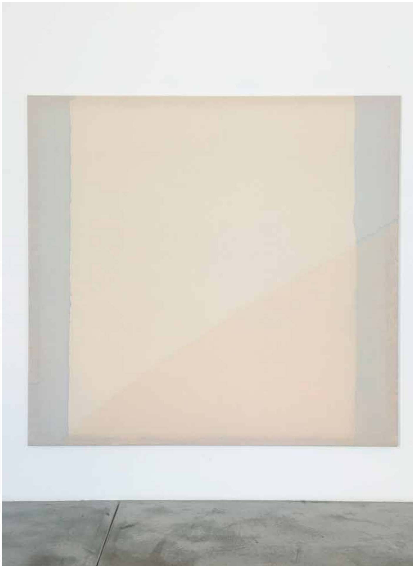
Untitled, 2014, fabric dye on canvas, 190 x 175 cm